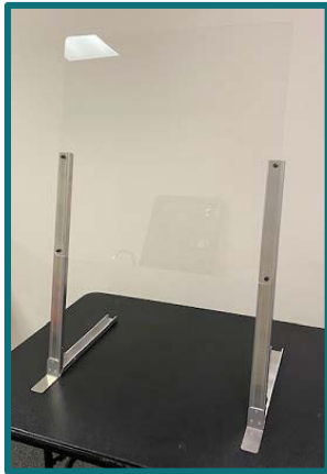
Table Top Sneeze Guards

Line up the holes and use two of the included screws to attach a leg to each side of the Plexiglas.